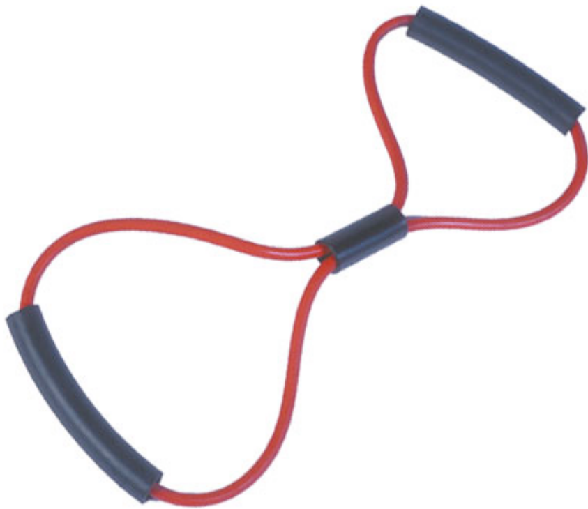
Figure 8 BF7545

Double the stretch band puts more tension into your stretch. Its "Figure 8" design provides maximum resistance.